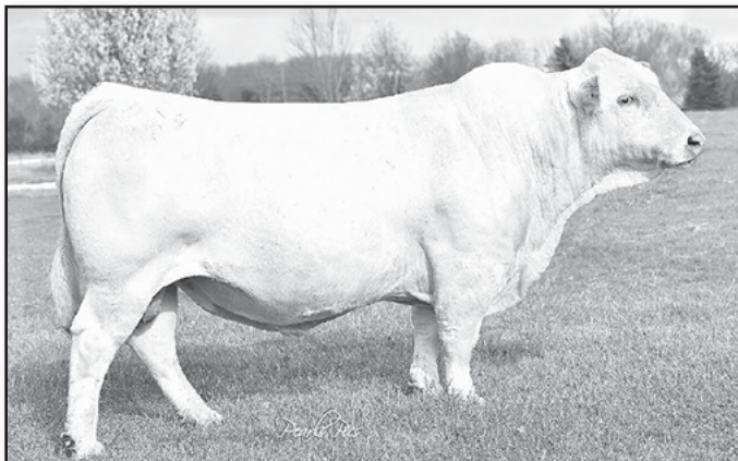
H LT RUSHMORE 7529 PLD Polled Reg. #M897768