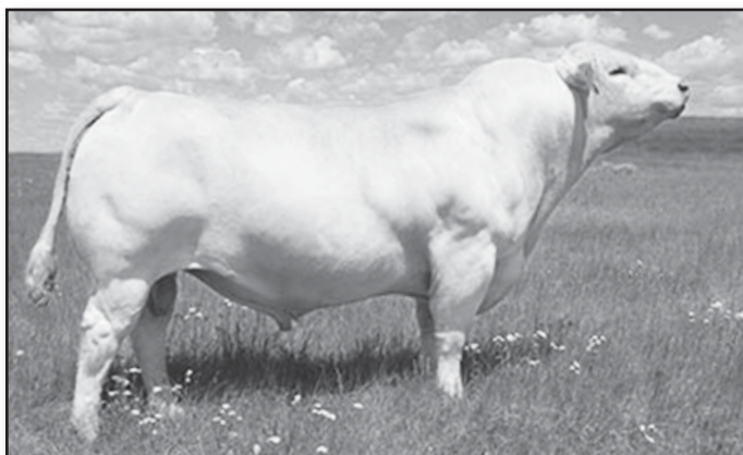
E LT TIOGA 4090 PLD Polled Reg. #M852840