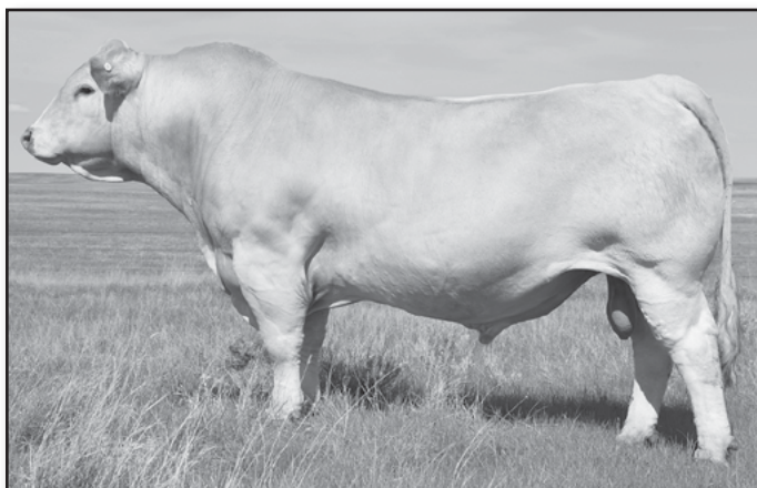
LT LANDMARK 5052 PLD Polled Reg. #: M866771