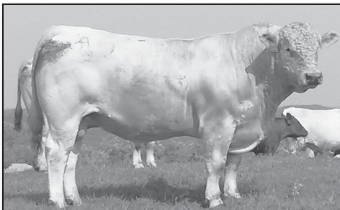
G LT COMMISSIONER 5232 PLD Polled Reg. #M866814