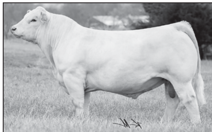
WC MILESTONE 8224 P Polled Reg. #: M915078

He is one of the easiest calving sires we have ever used. There is a very uniform group in this year's sale and he works great on the Fargo pedigree.