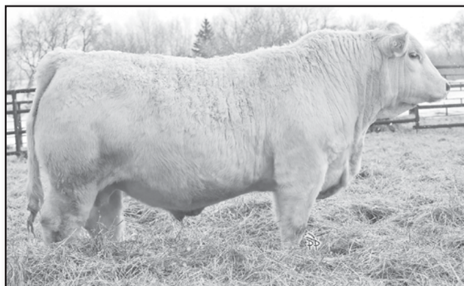
F HTA UNDECLARED 8115F Polled Reg. #M924864