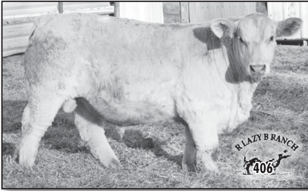
R LAZY B RANCH 415 RLB MR COMMISSIONER 415H Polled Reg. #M944725